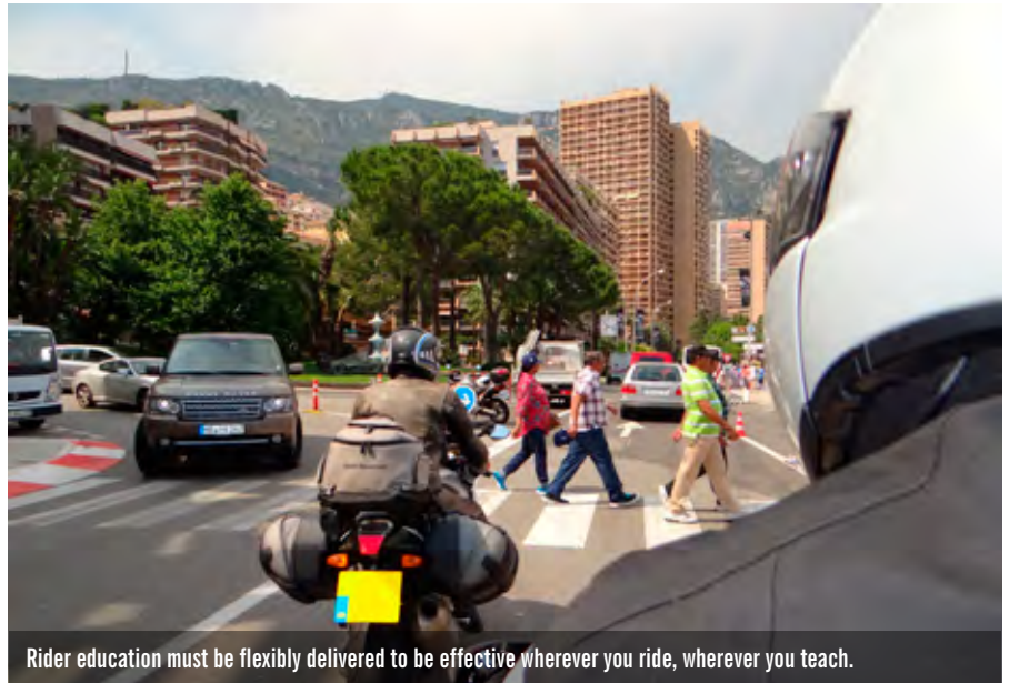
Rider education must be flexibly delivered to be effective wherever you ride, wherever you teach.

From the first day that I began advanced riding I have been told that looking and assessing skills will develop with mileage ridden but whatever standard you reach always be flexible and consider all of the options open to you.